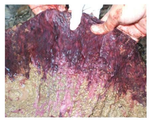
Figure 1.1.Case 6- Hyperemic Intestinal Mucosae