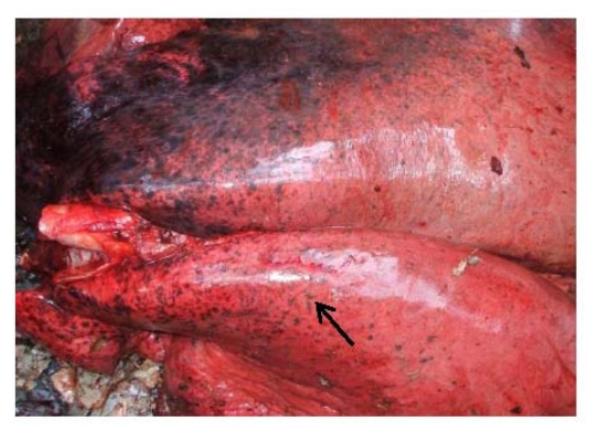
Figure 2.1.Case 3-Diffuse pettichiation in lung lobes